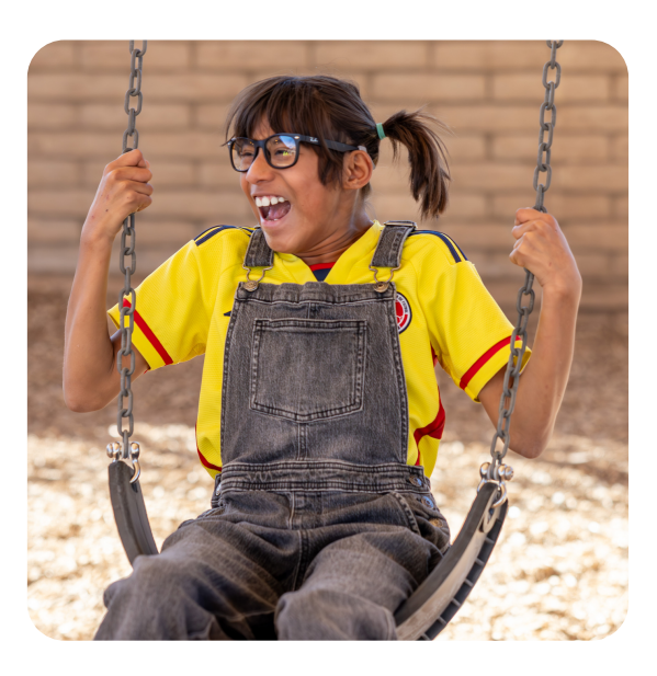
600 Families Served